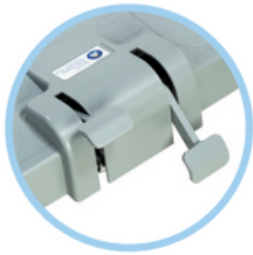
NEW! improved opening mechanism