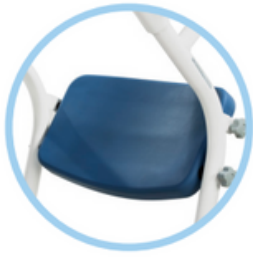
NEW! height adjustable leg pad