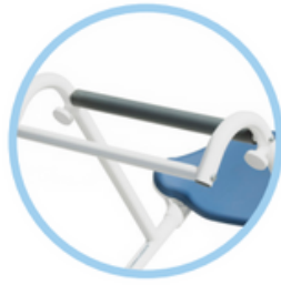
NEW! additional carer push bar